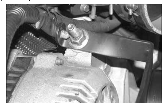
14. Push the wire harness-retaining clip into the hole on the tube-mounting bracket as shown. NOTE: Be sure the wire harness is clear of the throttle linkage.

13. Remove the upper alternator bolt and harness clip, and then secure the tube-mounting bracket (070018) to the alternator with the removed bolt.