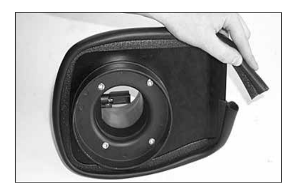
10. Apply the trim seal to the heat shield assembly as shown.