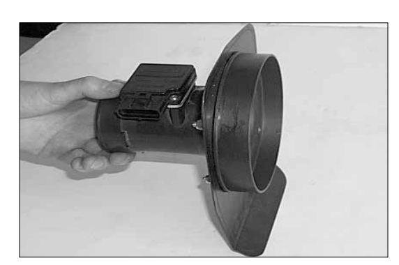
9. Assemble the mass air adapter, gaskets, heat shield and mass air sensor as shown.

8. Loosen and remove the four bolts that secure the mass air sensor, then remove the mass air sensor as shown.