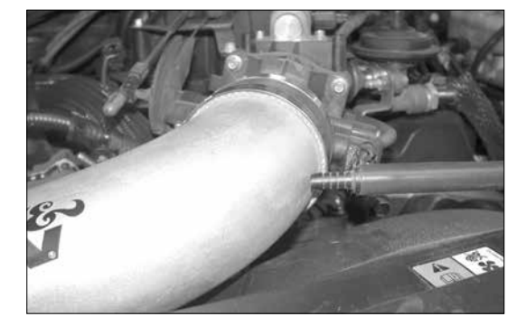
16. On vehicles that come equipped with a second vent line, line up the vent hose on the intake tube and make a mark on the intake tube for drilling.