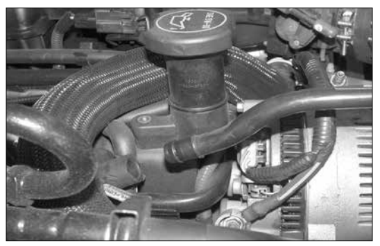
18. Remove the factory plastic crank case vent hose from the 90° elbow on the valve cover as shown.