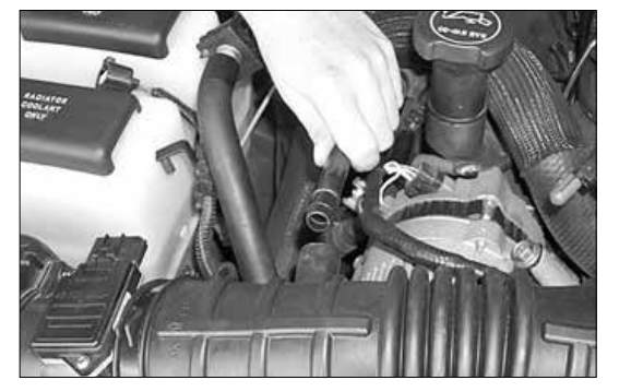
4. Remove the crankcase vent hose from the stock intake tube as shown.

3. Loosen and remove the three bolts that secure the throttle body cover, then remove the cover as shown.