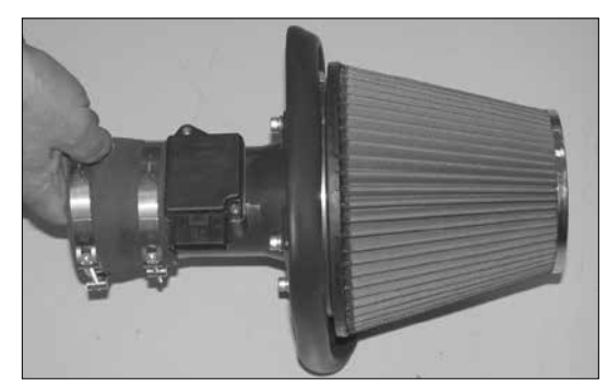
22. Assemble the K&N ^{\ensuremath{\$}} air filter onto the heat shield assembly as shown.

21. Vehicles that come equipped with a second vent line, reconnect as shown