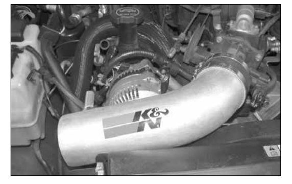
15. Install the K&N<sup>®</sup> intake tube onto the throttle body and line it up with the tube-mounting bracket, then secure with the hose clamp and hardware provided.