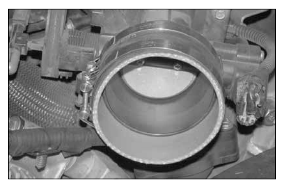
12. Install the silicone hose (08630) and the hose clamps onto the throttle body as shown.

11. Assemble the silicone hose (08051) and the hose clamps onto the heat shield assembly as shown.