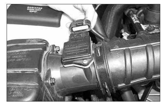
2. Disconnect the mass air sensor electrical connection.

3. Loosen and remove the three bolts that secure the throttle body cover, then remove the cover as shown.